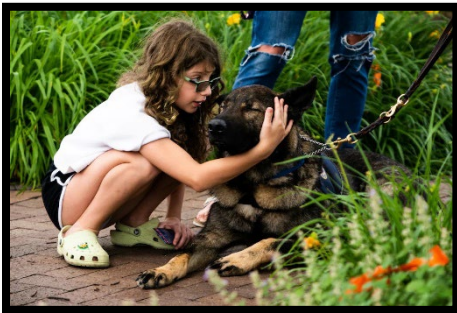
CRC Canine Tarik at Highland Park, Illinois

There is an unmistakable bond that exists between humans and canines. These captivating creatures become members of our families, sharing in our moments of joy and giving us comfort in times of sorrow. It is estimated in the United States, over 48 million households (38%) own dogs [1]. Some dogs are additionally trained to serve in roles as vital companions performing needed services, or to provide therapeutic interventions. A select very few progress to receive advanced training and elite certifications in order to skillfully and effectively interact following traumatic events. In these situations, they offer respite, provide moments of comfort and healing, and help to build resilience. This article serves to provide information on the various types of animal assisted interventions (AAI), and offer examples of appropriate scenarios for each.