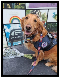
CRC Canine Macy at Pulse Nightclub Memorial

CRC Teams have responded to and interacted with countless first responders in the aftermath of tragic events. Additionally, CRC teams have deployed nationally to a myriad of events including, but not limited to, shootings at Pulse Nightclub, The Las Vegas Harvest Festival, Sutherland Texas First Baptist Church, Pittsburgh Tree of Life Synagogue, and the El Paso Walmart. Most recently, the CRC team deployed to the Surfside Florida Champlain Towers collapse, a post shooting event at Jefferson Hospital in Philadelphia, the shooting at Oxford High School in Michigan, and to Baltimore Maryland following the tragic loss of three firefighters a deployment to Virginia in support those impacted by the shooting death of two police officers at Bridgewater College, and to Uvalde Texas following the Robb Elementary School massacre to provide comfort to a devastated community.